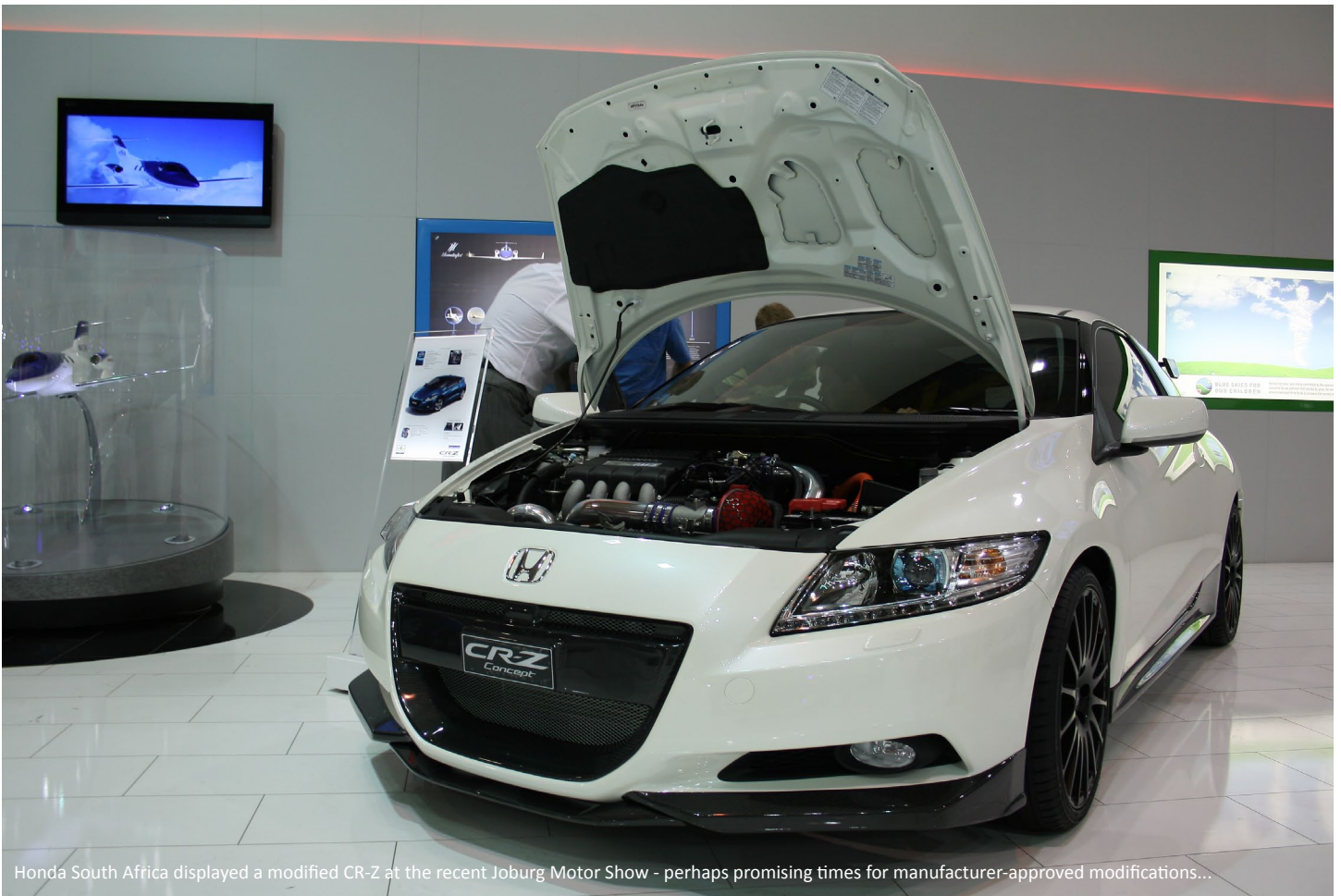
Honda South Africa displayed a modified CR-Z at the recent Joburg Motor Show - perhaps promising times for manufacturer-approved modifications...